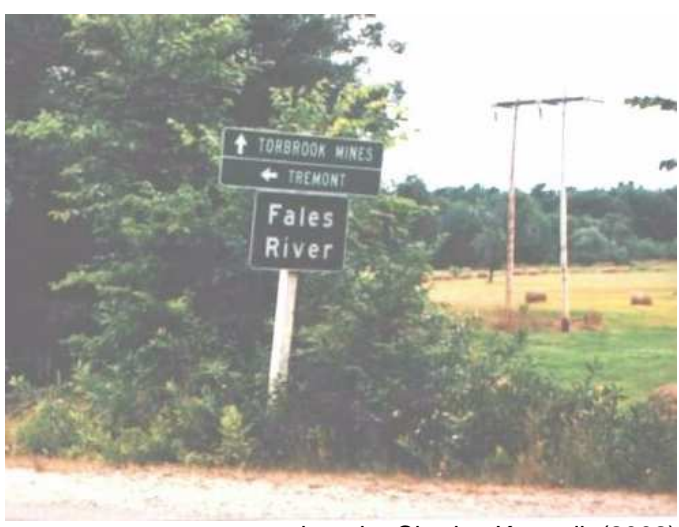
Fales River, Malvern Square, Nova Scotia, Canada

line with Kings County and near or at the bottom of North Mountain, now called Stronach Mountain. The area is known as Malvern Square. There is a Fales River and a Fales Brook still flowing in this area.