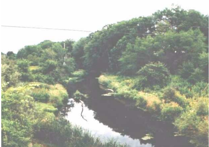
The Fales River, Malvern Square, Nova Scotia Canada